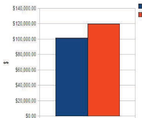
Year to Date: Giving vs. Budget (Through Sept. 5)

I know that we can all look forward to a terrific holiday season ahead, and a strong finish to the current year.